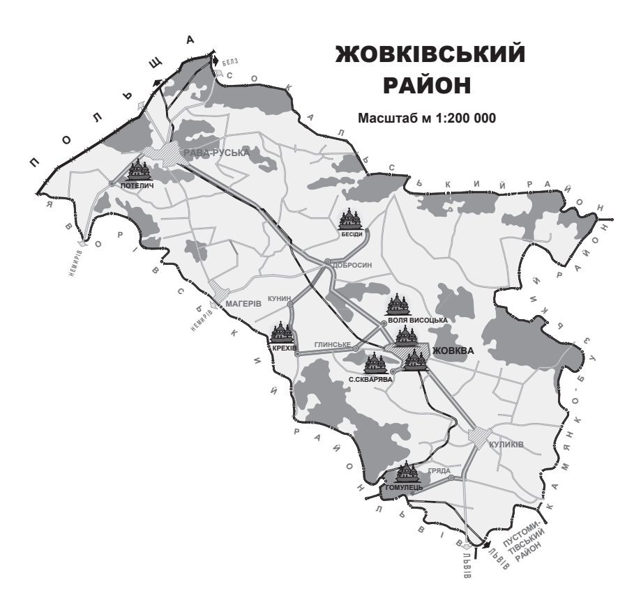
Fig. 4. Wooden tserkvas scheme of Zhovkva region proposed in the "Transboundary path of sacral wooden architecture" project (by A. Davydenko)

Institutions that deal with tourism are involved into the popularization of the town architecture properties. Each publication (e.g., album, prospectus or booklet), notes necessarily the availability of unique sacral wooden architecture heritage in the town and region. Wooden architecture is the subject of interest of many researchers working in the scientific institutions of the region. This information is shared at scientific conferences and published in scientific journals. In 2012 in the framework of the EU Neighbourhood Programme the project entitled "Transboundary path of sacral wooden architecture" on the example of the ways of wooden architecture in Poland was presented for co-financing.