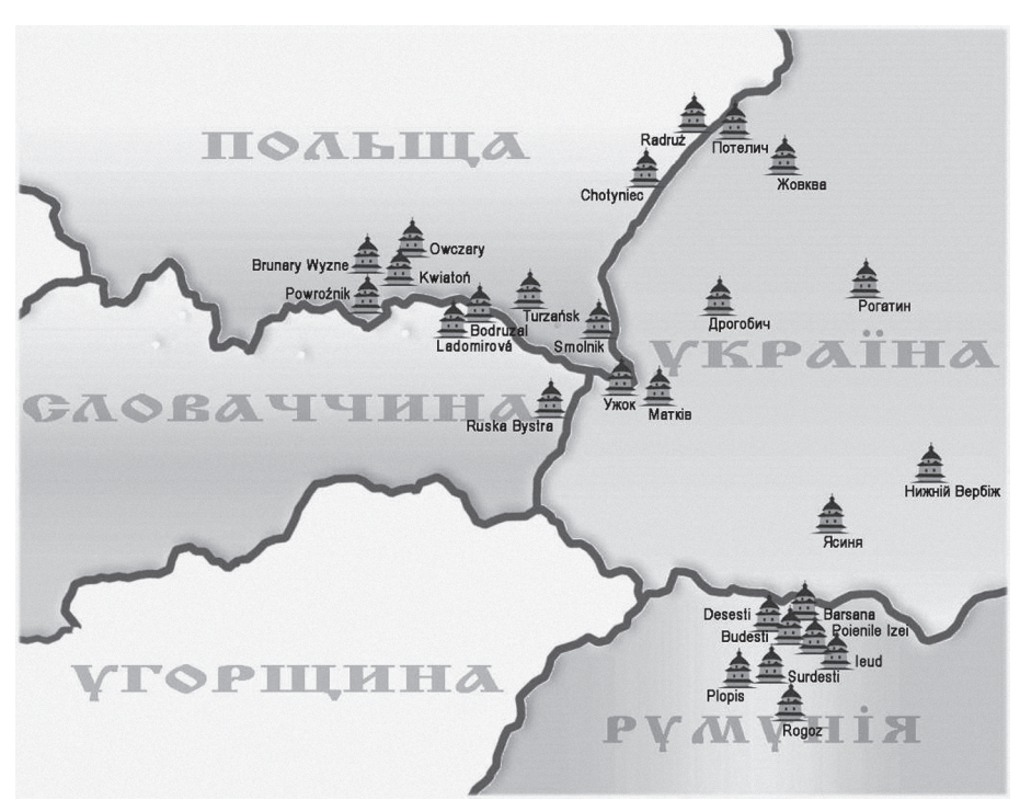
Fig. 1. Map of sacral wooden architecture objects in the Carpathians in the World Heritage List of UNESCO (Ukraine, Poland, Slovakia, Romania) by A. Davydenko