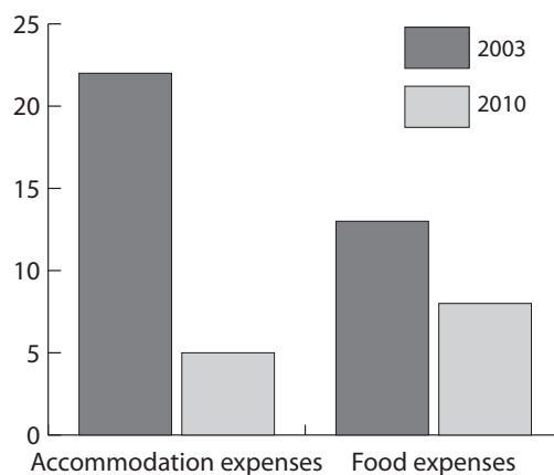
Fig. 2. Percentage of accommodation and food expenses incurred by tourists visiting the Lubelskie Voivodeship in 2003 and 2010