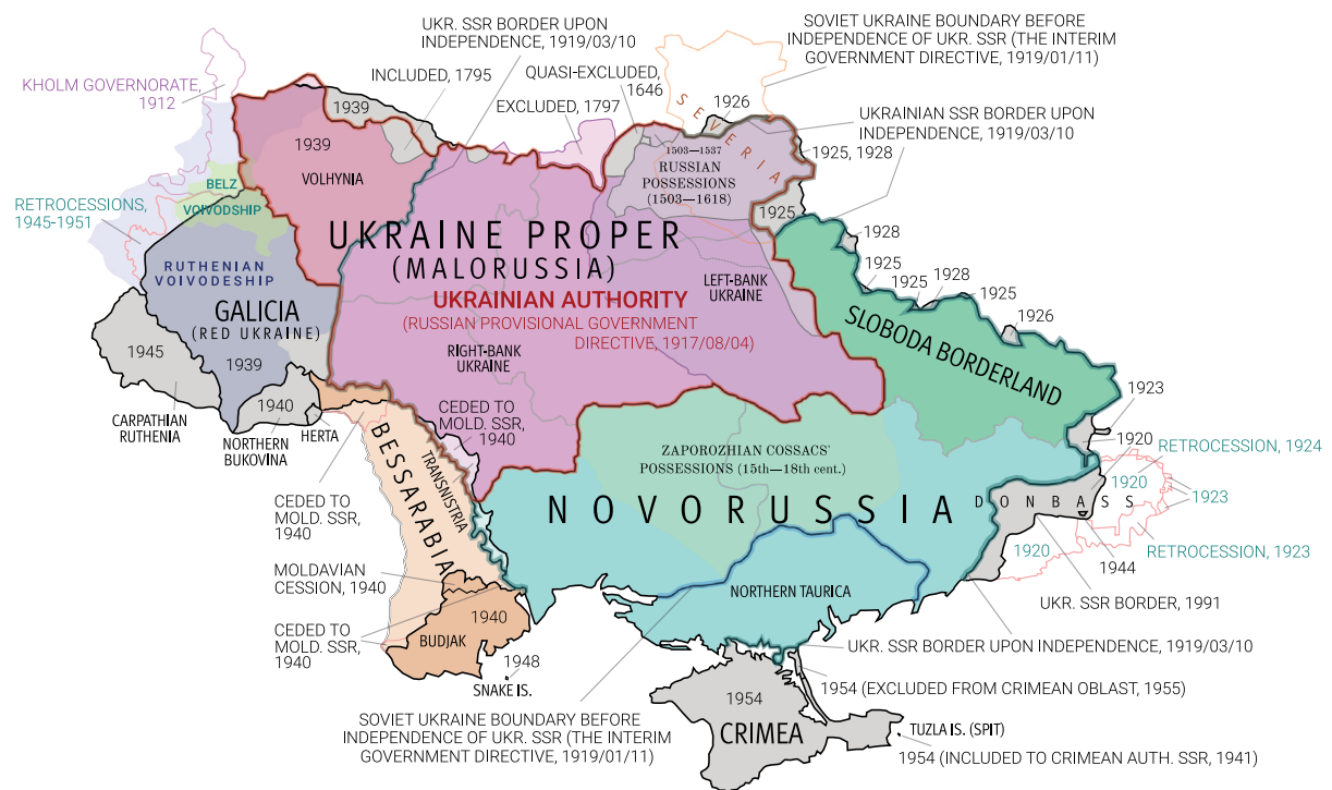
Figure 1. Russian propaganda showing Ukraine’s “historical” borders