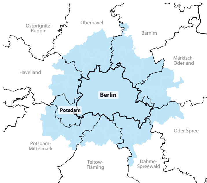
Fig. 2. Berlin-Potsdam City-Surroundings Interconnection Area (SUZ)

In the years 1990–2015, the highly urbanized and densely populated SUZ area (1 194 inhabitants per 1 km 2 in 2015) was characterized by a clearly gentler course of the transformation processes compared with the less urbanized peripheral areas located closer to the outer boundaries of Brandenburg. This difference manifested itself above all in the prevalence of positive effects of the changes over their negative consequences. The economies of scale and agglomeration, very advantageous location within the transport network, and the growing significance of the spatially integrated Berlin as a metropolitan center became the direct cause of the polarization of economic development not only on a regional scale, but on the scale of the entire East Germany. None of the negative transformation-related phenomena, such as recession in the manufacturing sector, unemployment or outflow of population, ever emerged in the Berlin agglomeration as clearly as in the poorly urbanized peripheral areas. As the largest city and the capital of Germany with a constantly expanding, diverse economic base and metropolitan functions, Berlin created very favorable