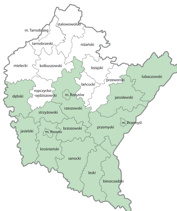
Fig. 3. Area of focus of activities for increasing the competitiveness of tourism products

Whereas the first two directions should be implemented throughout the Podkarpackie Voivodship, the third direction should be executed in the scope of OSI covering the southern and central part of the region (fig. 3).