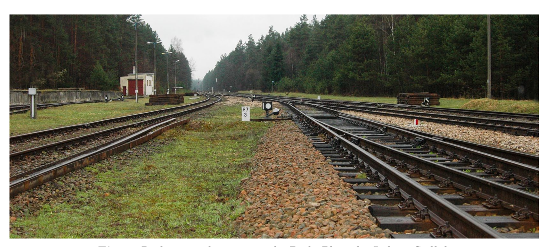
{\bf Fig.~2.} Railway tracks crossing the Park.

Recently, for the first time since the beginnings of the LHS, Spółka PKP Linia Hutnicza Szero-kotorowa (this is how the LHS abbreviation reads now) took action aimed at minimizing the negative influence of the railway on the environment (Grabowski and Bielak 2013). However, it does not change the fact that it will cut across the Park's ecosystem.