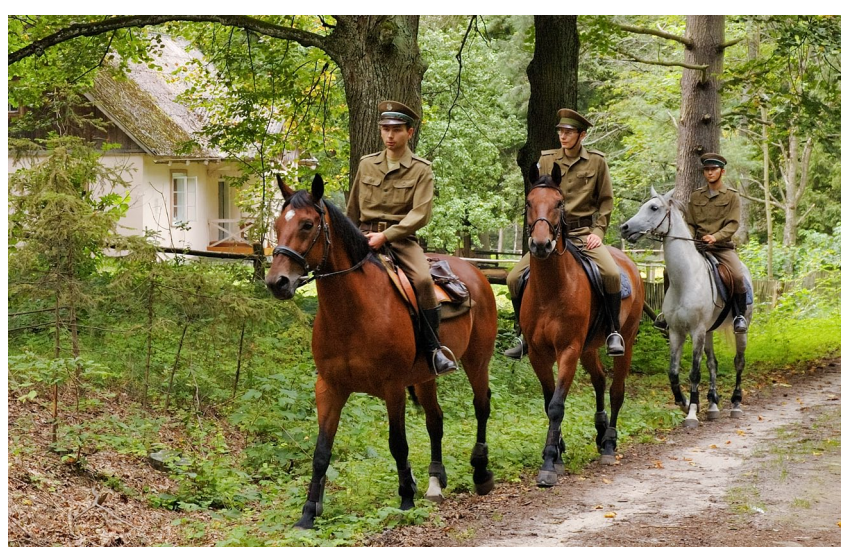
Fig. 1. Roztoczańska Konna Straż Ochrony Przyrody [Roztocze Mounted Nature Conservation Guards].

The protection of ecosystems and also in-depth knowledge of their functioning is only one of a range of tasks to be performed by the Park's Directorate and Science Council. It was very important to develop good relations between the RNP and the local community. It must be remembered, as mentioned before, that the concept of the Park establishment was not welcome by a lot of inhabitants of adjacent areas and enthusiasts of the project were few. Therefore, a favourable attitude of the local community had to be gained, amongst other things, by failure to execute the prohibition to penetrate the forest areas. It was decided that inhabitants' hostility would do more harm than local damage to the undergrowth by a relatively low number of people. More attention was paid to the behaviour of the growing number of tourists. In this case, Roztoczańska Konna Straż Ochrony Przyrody [Roztocze Mounted Nature Conservation Guards] proved to be very helpful. The guards wear uniforms and the name of the 25 Uhlan Regiment. From 1985 its patrols have been inspecting trails and paths in the summer, disciplining unruly visitors without punishing them however.