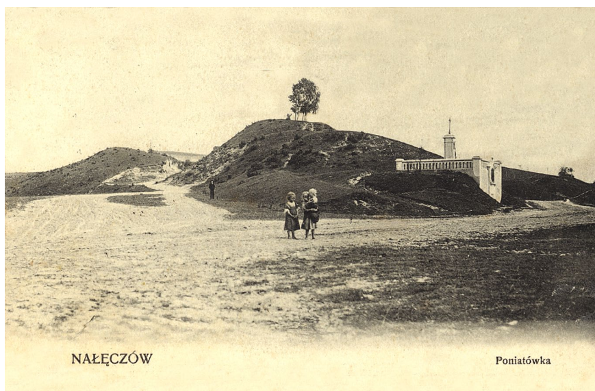
Fig. 2. Poniatowski Hill in Nałęczów in the postcard at the turn of the 19th and 20th century, unknown author

Upon the hill, 297 trees have been found (fig. 3). They belong to 16 taxons and the most common ones are: Acer platanoides , Pinus sylvestris , Populus canescens , and Betula pendula , Fraxinus excelsior , Alnus glutinosa , Robinia pseudoacacia , Tilia cordata , Quercus robur . There are 5 species of shrubs: Symphoricarpos albus , Juniperus communis , Padus avium , Sambucus nigra , and Prunus cerasifera . Due to the significant density of self-seeding trees, the species composition of the undergrowth is quite poor. According to the research results, the ground cover consists largely of ruderal species and a small proportion of dry-ground forest plants.