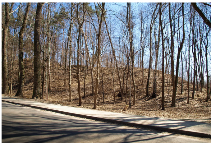
Fig. 1. Poniatowski Hill, view from the west side, from Dulębów street.

Góra Poniatowskiego is located 500 meters from the center of Nałęczów at one of the major roundabouts, between two public roads of varied importance: local (Dulębów Street) and regional (Graniczna Street). In both the immediate and more distant neighborhood there is residential